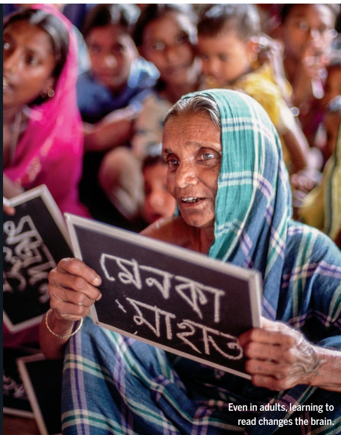
Even in adults, learning to read changes the brain.

Sci. Adv. 10.1126/sciadv.1602612 (2017).